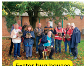
5-star bug houses

The Windsor and one of the Maidenhead Services, have visited Jungle Reptiles at Moss End Garden Centre. We peered into the homes of many interesting reptiles – everything from strange looking frogs to snakes, prior to a hands-on session, for those that wished to touch! First, we were introduced to a baby Leopard Tortoise, building confidence. Both sessions concluded with a cuddle with a 7 ft Boa Snake, which felt .... Just like a handbag.