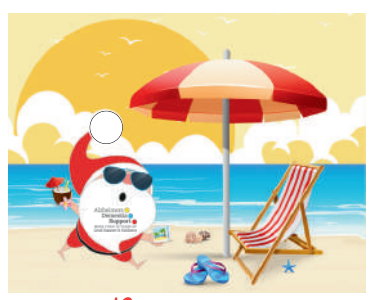
24th November 2024

We'll soon be launching the registration page, so keep an eye on our social media channels. The next 'ADS' Santa Fun Run will take place on 24th November 2024 at Eton Dorney Lake!